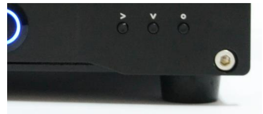
<easy operating buttons>