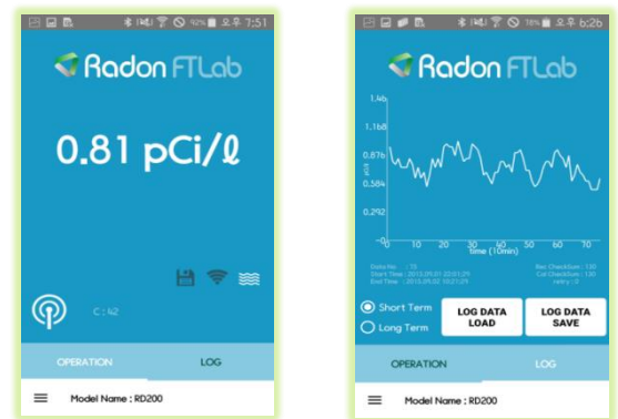
<smart phone App>