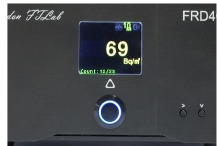
<typical front panel view >